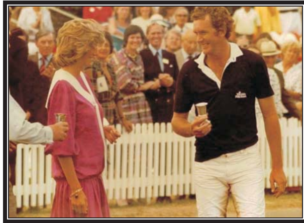
1984 Being presented a trophy by Her Royal Highness – Princess of Wales