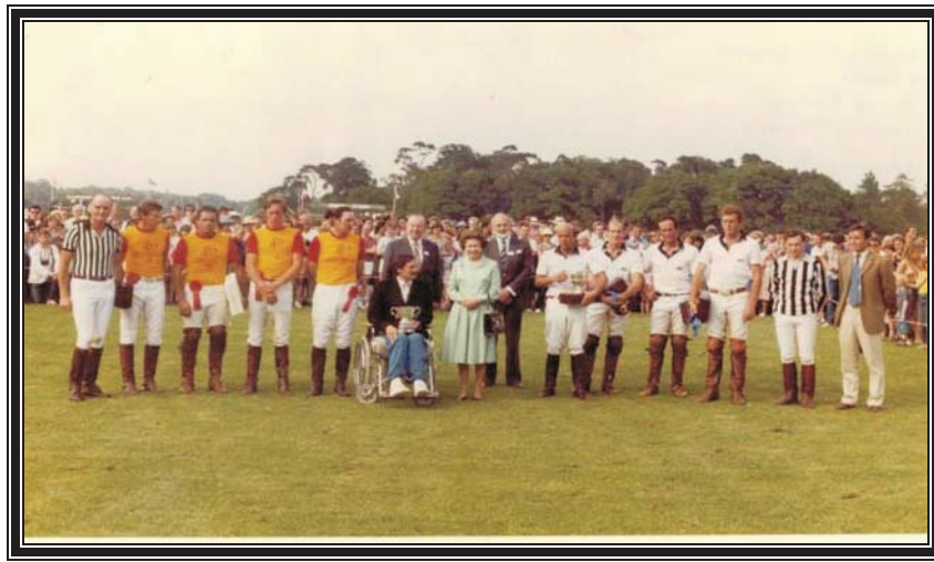
Team Photo – with Her Majesty – Queen Elisabeth II